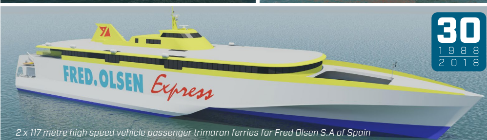
2 x 117 metre high speed vehicle passenger trimaran ferries for Fred Olsen S.A of Spain