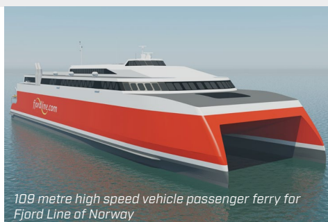
109 metre high speed vehicle passenger ferry for Fjord Line of Norway