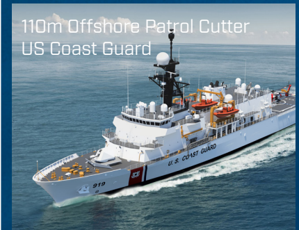
110m Offshore Patrol Cutter US Coast Guard