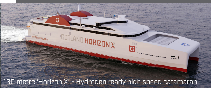
130 metre 'Horizon X' - Hydrogen ready high speed catamaran