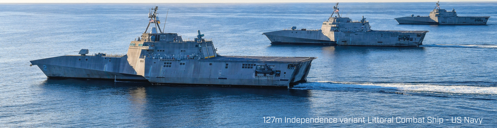
127m Independence variant Littoral Combat Ship - US Navy

Head of Design and Engineering, Henderson, Western Australia