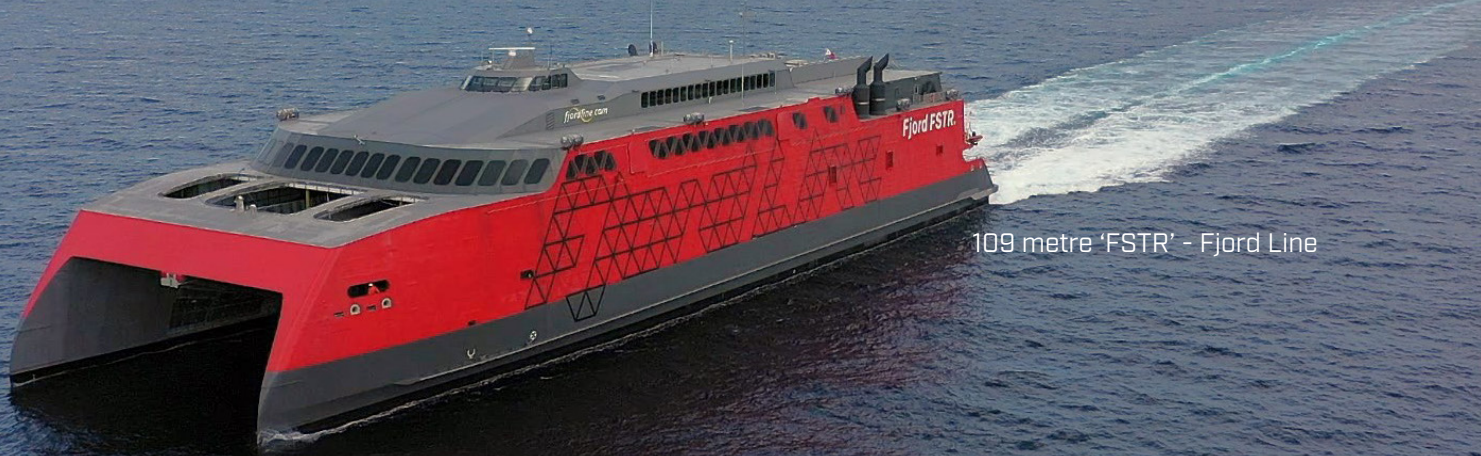
109 metre 'FSTR' - Fjord Line