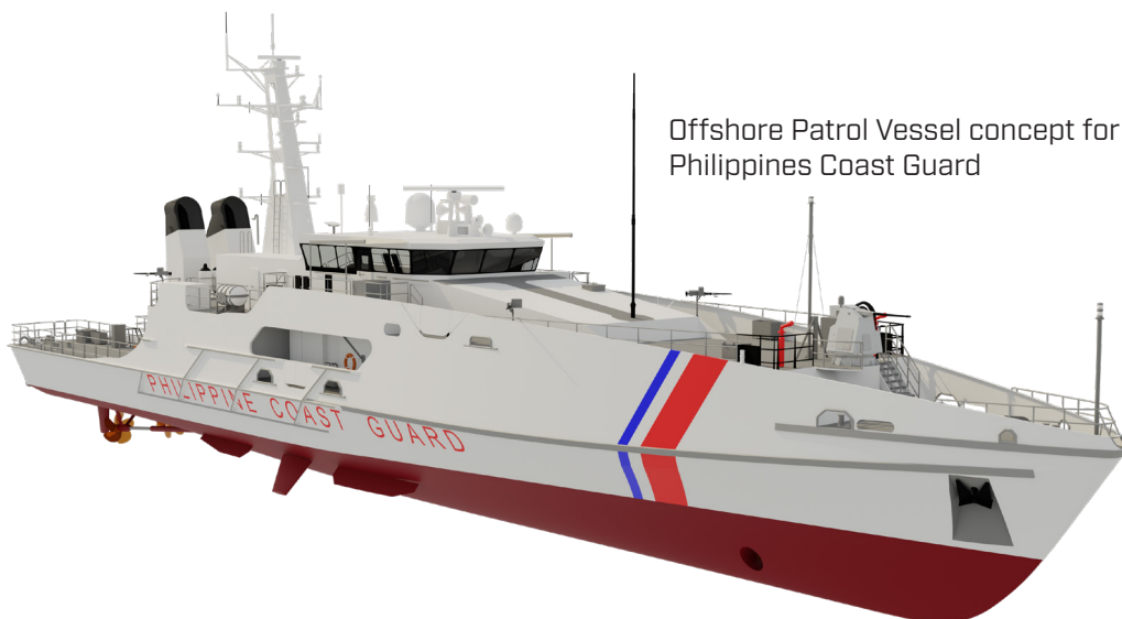
Offshore Patrol Vessel concept for Philippines Coast Guard

Austal has designed, built, and delivered: