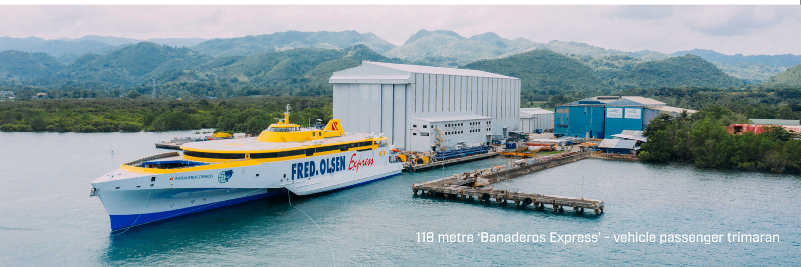
118 metre 'Banaderos Express' - vehicle passenger trimaran

Drawing upon a proven portfolio of naval vessels, produced worldwide since 1998, Austal Philippines is well positioned to play a leading role in the development of new Philippine Navy and Coast Guard capability - and contribute to the growth of the Philippines sovereign naval shipbuilding industry.