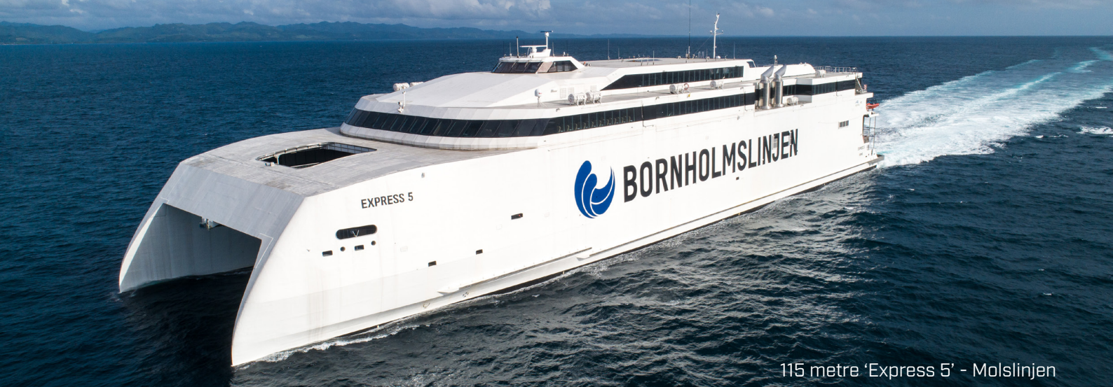
115 metre 'Express 5' - Molslinjen

Austal Philippines is geographically, financially and strategically positioned to cater to global market demands for high speed commercial vessels and naval vessels.